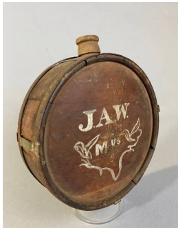
Title: Canteen Medium: Oak, iron, tin