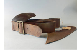
Title: Belt Medium: Tanned leather, brass buckle