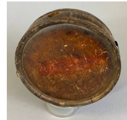
Title: Canteen Medium: Oak, iron, tin