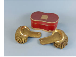
Title: Epaulets and Box Medium: Steel, brass, cotton, bullion wire, cardboard