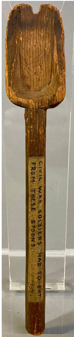
Title: Spoon Medium: Carved wood