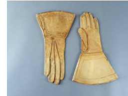
Title: Pair of Gloves Medium: Leather