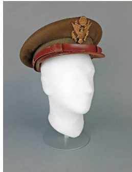
Title: Army Dress Uniform Hat Medium: Felted wool, plastic, cotton, canvas, leather, brass