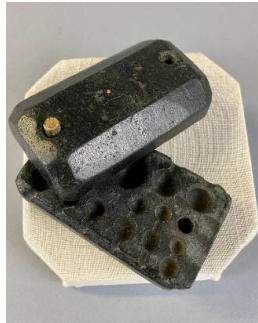
Title: Gang Bullet Mold Medium: Soapstone