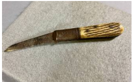
Title: Pen Knife Primary Maker: Asher Holmes Medium: Bone, steel blade