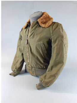
Title: Air Bomber Jacket Medium: Heavy cotton canvas, artificial fur, brass, cotton