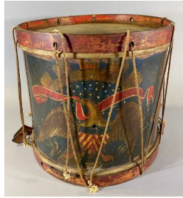
Title: Drum Primary Maker: Joseph LaMotte Medium: Pine, maple, ash, cotton cord, leather