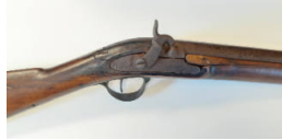
Title: Musket Medium: Walnut, iron, steel, brass