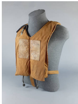
Title: Life Vest Medium: Rubberized canvas, cotton webbing, steel, zinc, rubber tubing