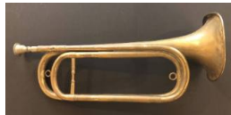
Title: Bugle Medium: Brass