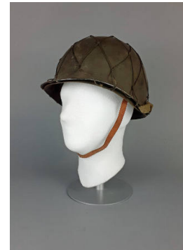
Title: Combat Helmet Medium: Steel, canvas, cotton, leather