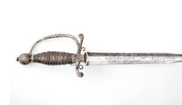
Title: Monckton Sword and Scabbard Medium: Steel, wood, silver, leather