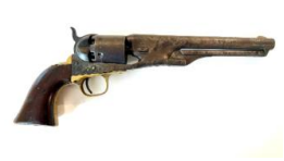
Title: Navy Colt Pistol Primary Maker: Colt's Manufacturing Company Medium: Walnut, steel, brass