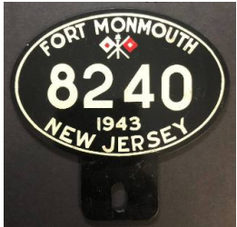
Title: Fort Monmouth Automobile Tag Medium: Plastic