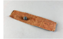
Title: Grape Shot and Storage Bag Medium: Lead; linen