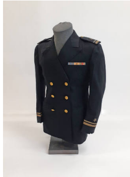
Title: Navy Uniform Jacket Medium: Wool, cotton, brass, steel