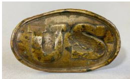
Title: Buckle Primary Maker: Charles Liming Medium: Brass