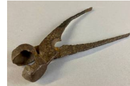
Title: Scissor Bullet Mold Medium: Iron