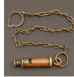
Title: National Guard Whistle Primary Maker: B & R Manufacturing Co. Medium: Copper, brass