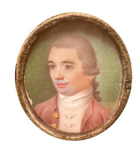
Title: Unidentified Gentleman Primary Maker: Unknown Maker Medium: Oil on ivory. Case of colorless glass, green velvet, snakeskin, brass, wood