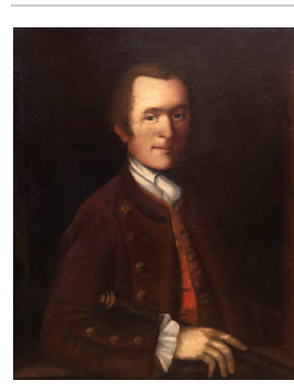
Title: Fenwick Lyell Medium: Oil on canvas