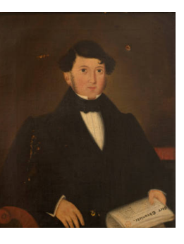
Title: Man with Newspaper Primary Maker: Unknown Artist Medium: Oil on canvas