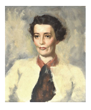
Title: Gertrude Woodcock Simpson Primary Maker: William Percy Couse Medium: Oil on masonite