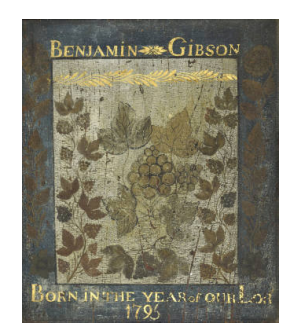
Title: Benjamin Gibson Birth Record Primary Maker: Unknown Artist Medium: Oil and gold leaf on wood panel