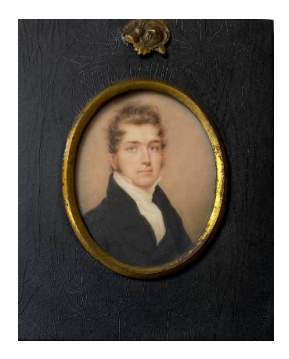
Title: Peter Dubois Primary Maker: Unknown Artist Medium: Oil on ivory, colorless glass, gilt metal, wood, cardboard