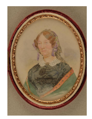
Title: Penelope Minturn Medium: Watercolor on paper, glass, velvet and silk case frame