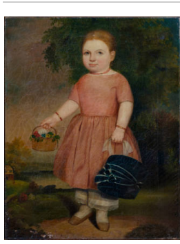
Title: Laura Stillwell Primary Maker: Unknown Artist Medium: Oil on canvas