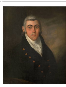
Title: Gouverneur Morris Primary Maker: Unknown Artist Medium: Oil on canvas