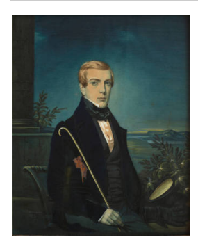
Title: Man with Cane and Top Hat Primary Maker: Charles Fenderich Medium: Gouache and watercolor over graphite on paper