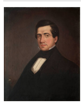
Title: Unidentified Man in a Black Suit Primary Maker: Unknown Artist Medium: Oil on canvas