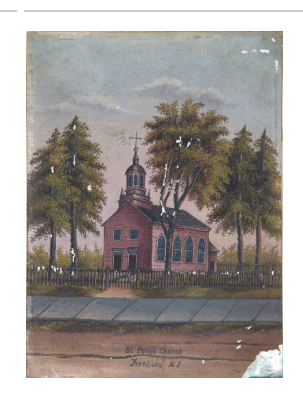
Title: St. Peter's Church Primary Maker: Carrie A. Bowne Swift Medium: Oil on metal

Title: St. Peter's Church Primary Maker: Carrie A. Bowne Swift Medium: Oil on abalone shell