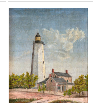
Title: Main Lighthouse, Sandy Hook: Southwest View Primary Maker: Franklin Patterson Medium: Oil on canvas