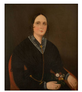
Title: Unidentified Woman with Flowers Primary Maker: Unknown Artist Medium: Oil on canvas

Title: Unidentified Man with White Hair Primary Maker: Harvey Jenkins Medium: Oil on canvas