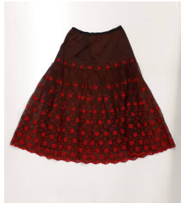
Title: Petticoat Medium: Nylon netting, nylon stretch fabric, nylon lace, elastic