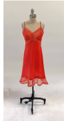
Title: Slip Medium: Tricot nylon, acetate satin, plastic