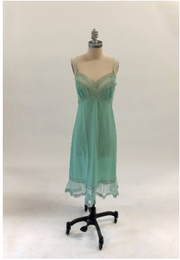
Title: Slip Medium: Tricot nylon, acetate satin, plastic