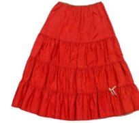
Title: Petticoat Medium: Nylon silk, cotton