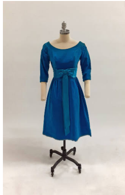
Title: Dress Medium: Synthetic velvet, cotton, acetate ribbon