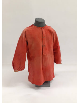
Title: Undershirt Medium: Wool flannel, cotton