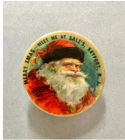
Title: Salz's Christmas Button (Keyport) Primary Maker: Ehrman Manufacturing Co. Medium: Celluloid, metal alloy