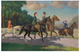
Title: Black Beauty Primary Maker: George Ford Morris Medium: Oil on pressed millboard