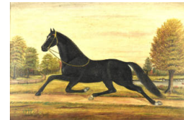
Title: The Horse Modoc Primary Maker: Unknown Artist Medium: Oil on artist's board