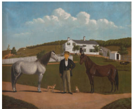
Title: The Crawford House with Horses Lady Blanch and Little Fan Primary Maker: Alfred Eduard Beguin Medium: Oil on canvas with hand colored photographic insert