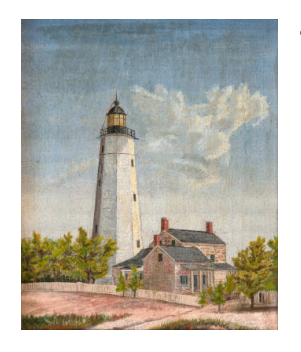
Title: Main Lighthouse, Sandy Hook: Southwest View Primary Maker: Franklin Patterson Medium: Oil on canvas