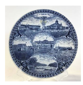
Title: "Views of Asbury Park" Plate Primary Maker: Rowland & Marsellus Co. Medium: Transfer-printed and glazed earthenware