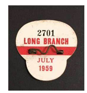
Title: Long Branch Beach Badge Medium: Plastic, metal