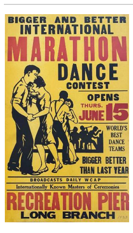
Title: Broadside Primary Maker: Barney & Co. Medium: Paper