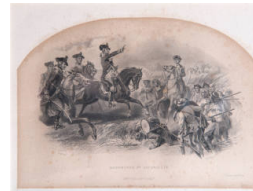
Title: Washington at Monmouth Primary Maker: Felix O. C. Darley Medium: Steel engraving on paper