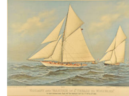
Title: Vigilant and Valkyrie in a "Thrash to Windward" Primary Maker: Currier & Ives Medium: Chromolithograph on paper