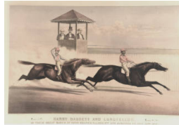
Title: Harry Bassett and Longfellow Primary Maker: Unknown Artist Medium: Chromolithograph on paper