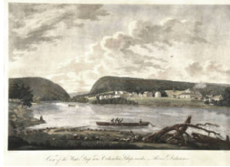
Title: View of the Water Gap and Columbia Glass Works - River Delaware Primary Maker: Thomas Birch Medium: Aquatint and engraving, with color added