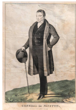
Title: General La Fayette Primary Maker: Nathaniel Currier Medium: Lithograph with hand coloring