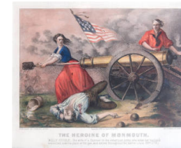
Title: The Heroine of Monmouth Primary Maker: Currier & Ives Medium: Lithograph on paper