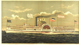
Title: Steamboat Republic Bound for Cape May Primary Maker: Century Lithograph Company of Philadelphia Medium: Chromolithograph on paper