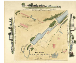
Title: Map of the Howell Works, Monmouth County Primary Maker: Endicott & Co. Medium: Lithograph on paper with color added