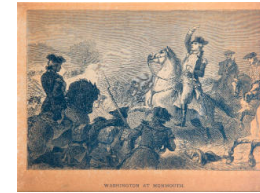
Title: Washington at Monmouth Primary Maker: Felix O. C. Darley Medium: Engraving on paper