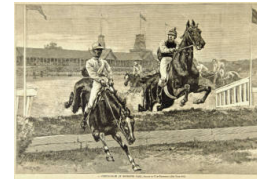
Title: A Steeplechase at Monmouth Park Primary Maker: Thure de Thulstrup Medium: Wood engraving on paper