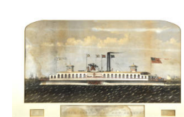
Title: Steam Ferry Boat New Jersey Primary Maker: Endicott & Co. Medium: Chromolithograph on paper