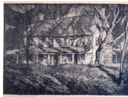
Title: Revolutionary Times in New Jersey Primary Maker: Howard N. Cook Medium: Woodcut on paper with black ink