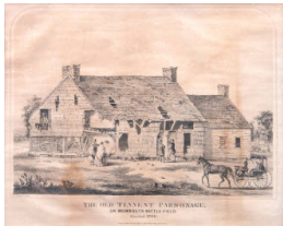
Title: The Old Tennent Parsonage on Monmouth Battlefield Primary Maker: Charles Currier Medium: Lithograph on paper