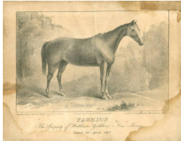
Title: Fashion, The Property of William Gibbons New Jersey Primary Maker: Eugene Sintzenich Medium: Black ink on paper