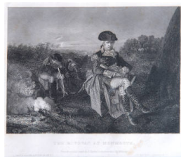
Title: The Bivouac at Monmouth Primary Maker: John Chester Buttre Medium: Steel engraving on paper