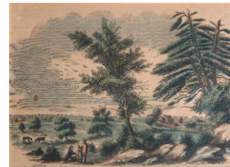
Title: View of the Monmouth Battle-Ground, New Jersey Primary Maker: John H. Schenck Medium: Woodblock engraving on newsprint with handpainted watercolor