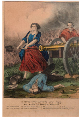
Title: The Women of '76. Molly Pitcher The Heroine of Monmouth Primary Maker: Currier & Ives Medium: Lithograph on paper