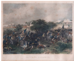
Title: Battle of Monmouth Primary Maker: Robert Hinshelwood Medium: Steel engraving and watercolor on paper