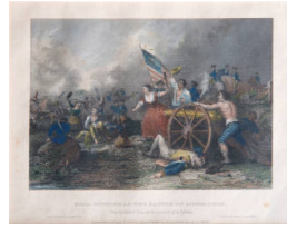
Title: Moll Pitcher at the Battle of Monmouth Primary Maker: John Rogers Medium: Engraving on paper with watercolor enhancements