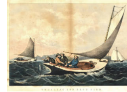
Title: Trolling for Blue Fish Primary Maker: Currier & Ives Medium: Chromolithograph on paper