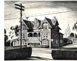
Title: Monmouth House Primary Maker: Pierre Sanford Ross III Medium: Black ink on paper