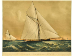
Title: The Cutter Genesta, R. Y. S. Primary Maker: Currier & Ives Medium: Chromolithograph on paper