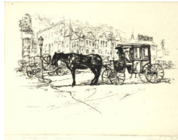
Title: The Station Hack, Asbury Park Primary Maker: Howard N. Cook Medium: Black ink on paper