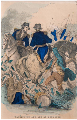
Title: Washington and Lee at Monmouth Primary Maker: Unknown Artist Medium: Woodcut engraving on paper with watercolor enhancements