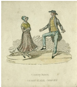
Title: Country Dance. Union Hall. Jersey Primary Maker: Edward Williams Clay Medium: Black ink on paper, with hand coloring